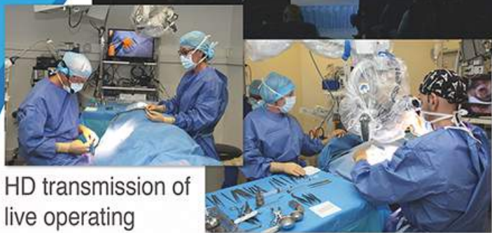
HD transmission of live operating procedures